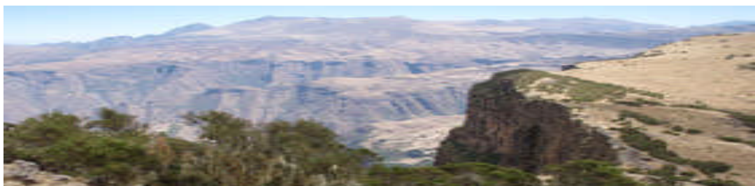
Bale Mountains Ethiopia

Spend 10 days in Ethiopia, exploring one of the oldest countries in the world, rich in culture and legend. We will travel south and visit two projects which your money will help support; you will have the opportunity to speak to the people who have benefited from your fund raising efforts!